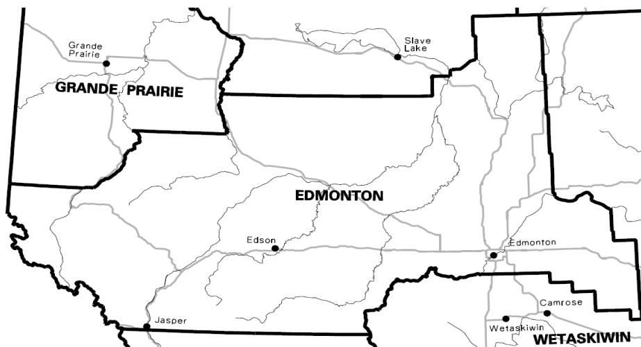
Figure 1 – Map of the Edmonton Judicial District